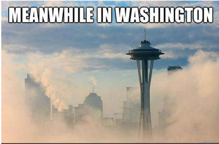
Recreational Marijuana Legalization in the U.S. Currently, eight states allow recreational marijuana use.