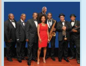
May 26 THE ELD WE BREZE BAND Mowtown/R & B