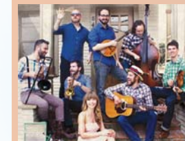
May 19 THE DUSTY W/ REVIVAL Americana/Bluegrass