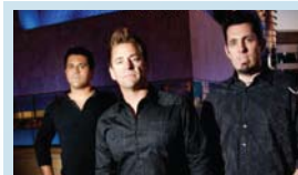
May 5 THE REFLEX 80s New Wave

This year's Spring Concerts, offered by the City and sponsored by the Desert Recreation District offer a variety of talented acts designed to please music lovers of all ages and tastes including