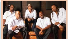
May 12 UPSTREAM Reggae