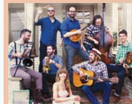
May 19 THE DUSTBOWL REVIVAL Americana/Bluegrass